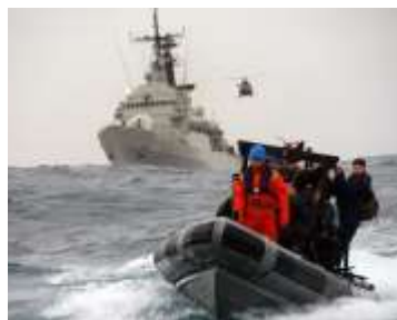
Official U.S. Navy file photo of Sailors attached to the Peruvian frigate Palacios (FM-56) approaching the stern gate of dock landing ship USS Pearl Harbor (LSD 52), during multi-national passenger transfers in UNITAS 48-07.